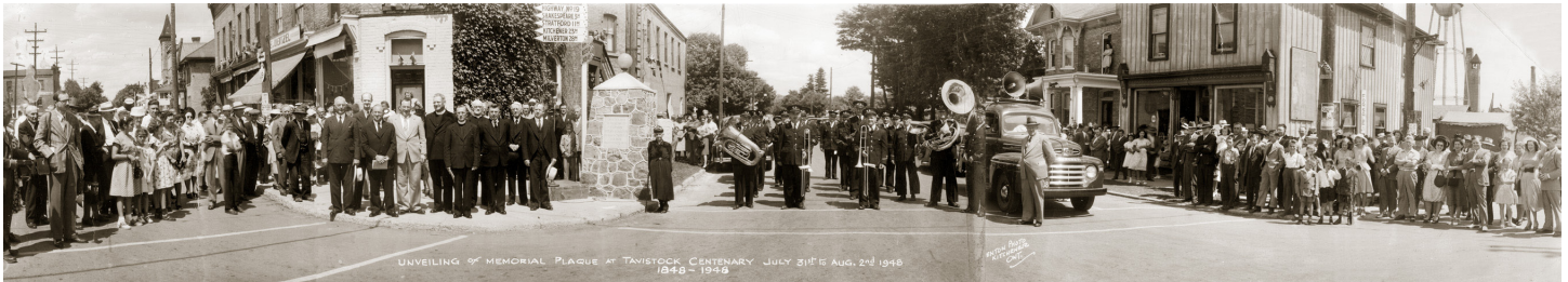
Tavistock Celebrates 100 Years in 1948 (above) and 150 years in 1998 (below)

Our trip starts at the five corners in Tavistock. Please park your car and walk to the front of the Post Office.