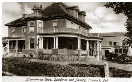
Zimmerman Bros., Residence and Factory, Tavistock, Ont.