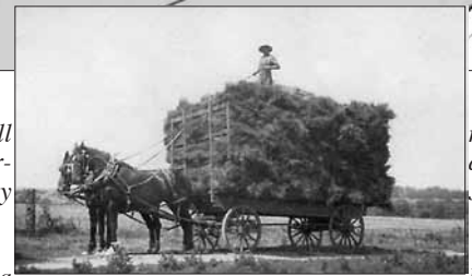
At right, bringing a load of flax to the mill