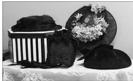
Millinery items now on display

We have also been very busy with many projects which include the collecting of historical data from Tavistock and area. The Archives have many census, cemetery records, family histories, photos from the Lemp collection, scrapbooks, Veteran records, photos and much more local information. Our Oral History Library is growing with DVDs of local interviews with individuals who have much knowledge of our history. The committee has plans to expand this Library including many historical facts and information from individuals and corporations. The Year of the Veteran project has turned out to be a much larger undertaking than first visualized. It has now extended into its second year of collecting names, data and photos from families and friends of Veterans of the Boer, First & Second World Wars and other conflicts in which our Canadian Veterans were involved. We have produced a DVD of their photos and names and will soon update it to include over 350 Veterans. We are now in the process of compiling several books as a permanent record for our Archives including photos, written records and names of over 500 Veterans.