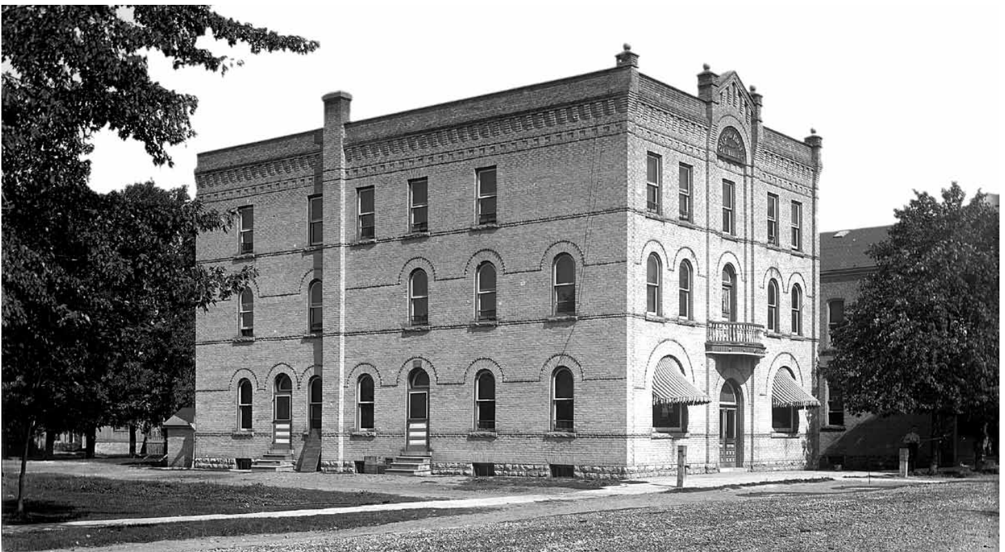
THE LEMP STUDIO COLLECTION

The Oxford Hotel has continuously served patrons for 102 years ... through two World Wars, prohibition, the Great Depression, the swinging sixties and clear through to the new millenium. Several generations of children were born and raised at the Oxford. For many single male full-time boarders, the Oxford was home. Throughout the years, the heart and soul and public perception of the Oxford has always been a reflection of the hotelkeeper.