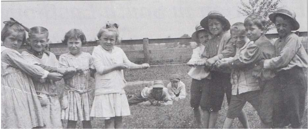
The Girls Take On The Boys In Tug of War date not known