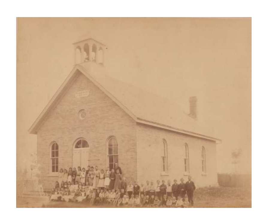
Then and Now Neither photo is dated.