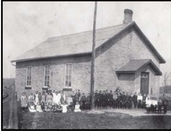
second school - circa 1895

corner of the 11th Line and the Maplewood Sideroad