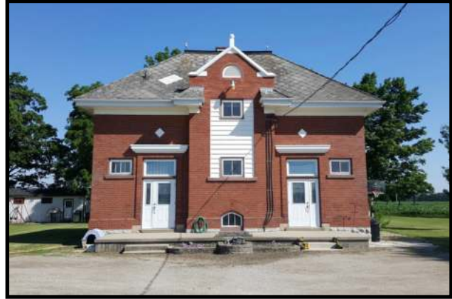
third school - present day 2020

Picture this. It's 1855 and you are a student at the brand new schoolhouse on the southeast corner of Lot 34, Concession 10 in East Zorra Township. As you enter the log building the first sight is the big box stove sitting solidly in the center of the room. The desks are all bolted to the walls on the two sides of the building. You take your place on a moveable bench facing the wall. Miss Teeple, the teacher, calls the pupils in all 8 grades to order and the school day begins. It's important that you listen and learn. Your parents are paying 2 shillings 3 pence per month for you to attend. In today's money that would be the equivalent of $15 a month ... a small pittance now but a huge outlay for yesterday's pioneer families.