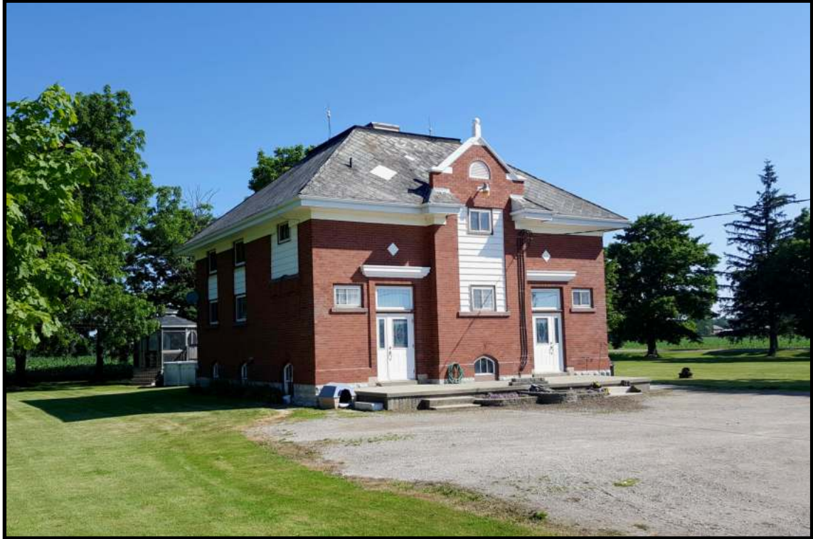
S.S. No. 8 - first Gorings School and now a private home stands proudly on a busy corner. Photos taken summer 2020.